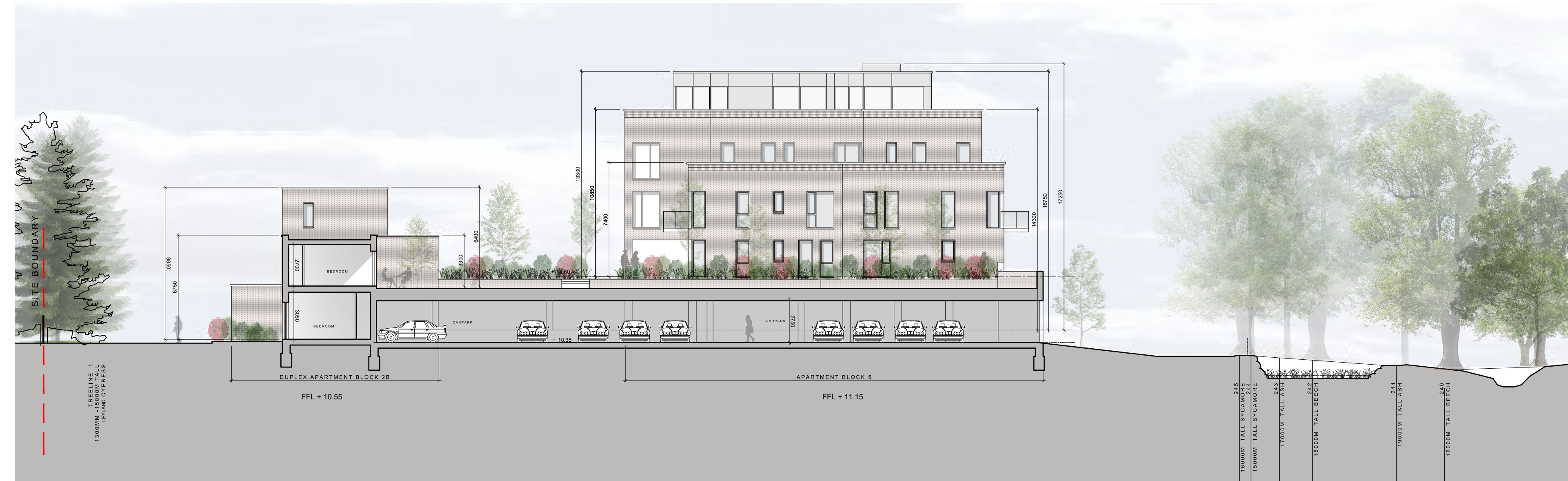
SITE SECTION Q - Q SCALE: 1:200 NOTE: SEE LANDSCAPE ARCHITECTS DRAWINGS FOR BOUNDARY TREATMENTS SEE ARBORISTS REPORT FOR DETAIL ON EXISTING TREES DOTTED RED LINE INDICATES SITE BOUNDARY