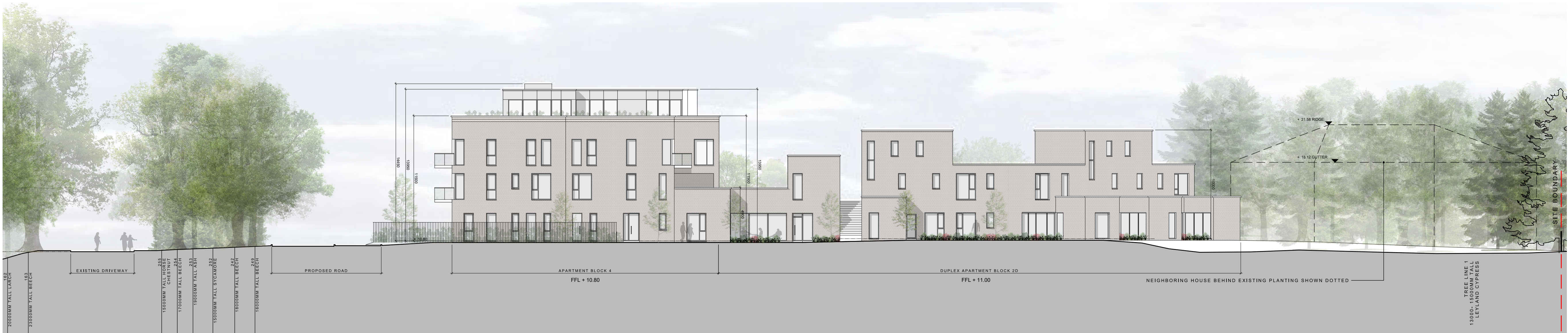
SITE SECTION O - O SCALE: 1:200 NOTE: SEE LANDSCAPE ARCHITECTS DRAWINGS FOR BOUNDARY TREATMENTS SEE ARBORISTS REPORT FOR DETAIL ON EXISTING TREES DOTTED RED LINE INDICATES SITE BOUNDARY